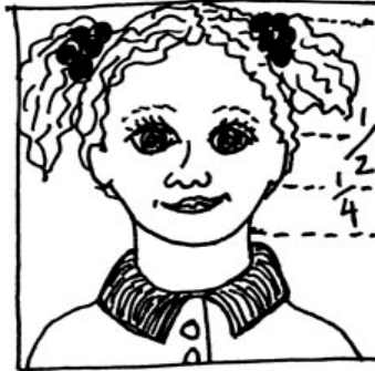
Proportions of the head